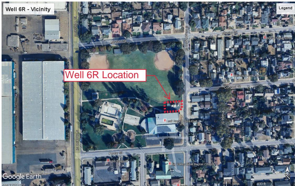
Figure 1 - Well 6R Project Location